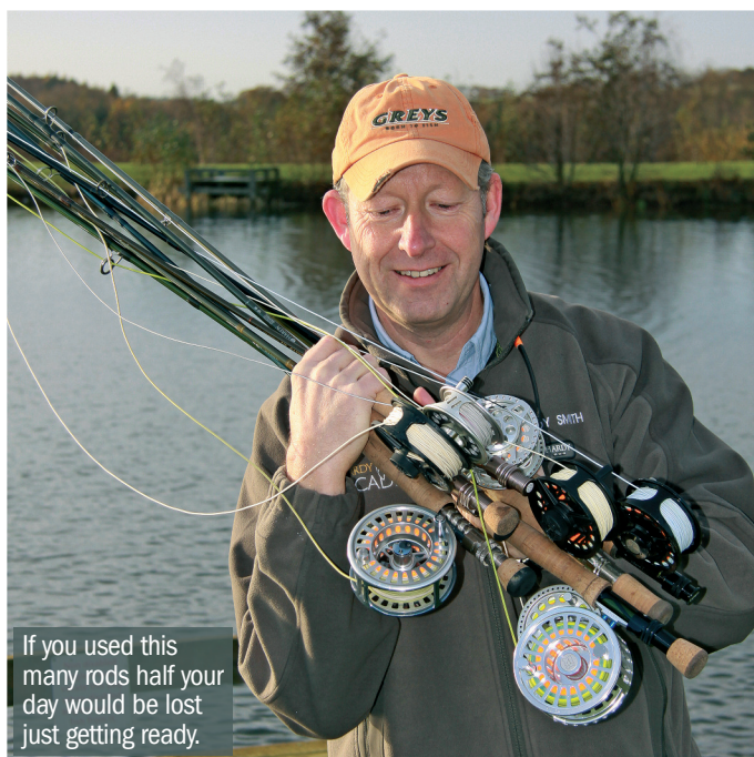
If you used this many rods half your day would be lost just getting ready.